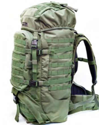
997 IDF Backpack 90 L