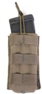
Single Cartridge Pouch