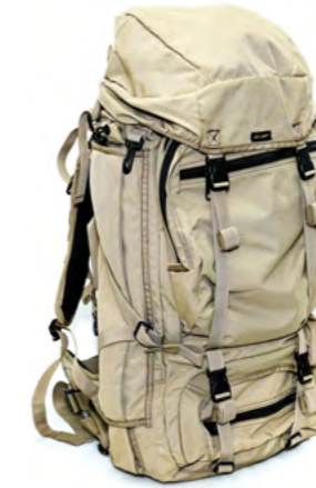
960 Backpack 60 L