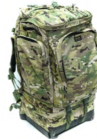
Unique Filtration System Carrier