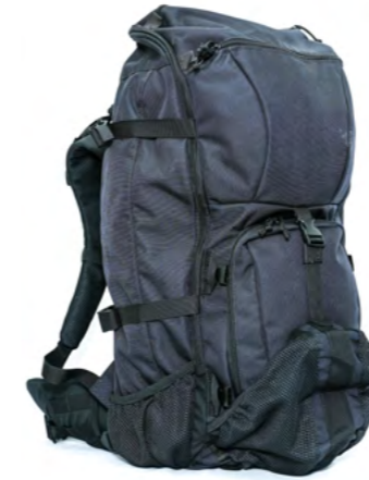
Mega Backpack 60 L

LIOR HAS VARIOUS CARRIERS AND BACKPACKS FOR DIFFERENT MISSION NEEDS AND REQUIREMENTS