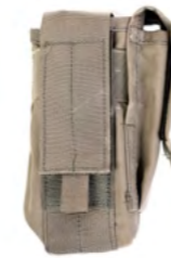
IDF Cartridge Pouch