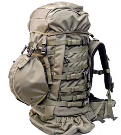
992 Backpack 90 L