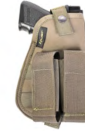
Advanced Pistol Pouch