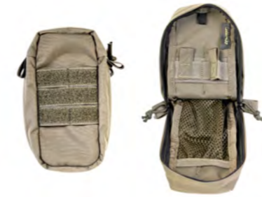
Vertical Utility Pouch